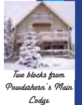
Two blocks from Powderhorn's Main Lodge