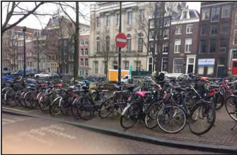
←THE BIKES OF AMSTERDAM