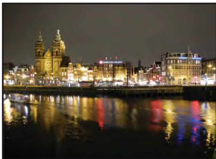
AMSTERDAM AT NIGHT