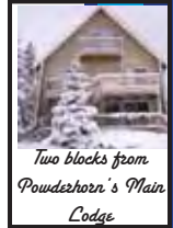
Two blocks from Powderhorn's Main Lodge