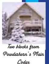
Two blocks from Powderhorn's Main Lodge

www.windsong-lodging.com Ph: 920-427-6086 E-mail: windsonglodging@yahoo.com