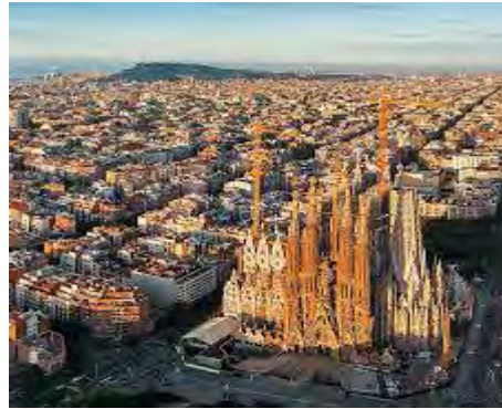
Cathedral Sagrada Familia Barcelona

In the 3-Valleys France, Largest in the World 166 Ski Lifts, 375 Miles of Groomed Runs