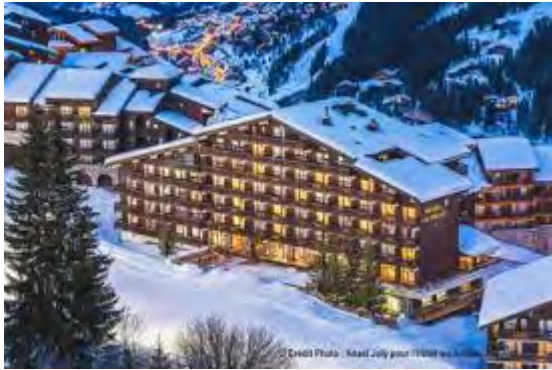
Hotel Arolles, Ski In-Ski Out

In the 3-Valleys France, Largest in the World 166 Ski Lifts, 375 Miles of Groomed Runs