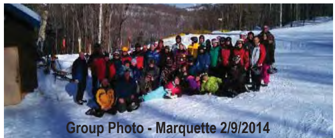
Group Photo - Marquette 2/9/2014