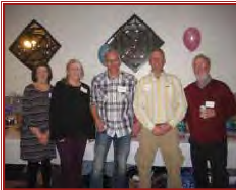
TREASURER • SECRETARY • PRESIDENT • VICE PRESIDENT • ADVISOR